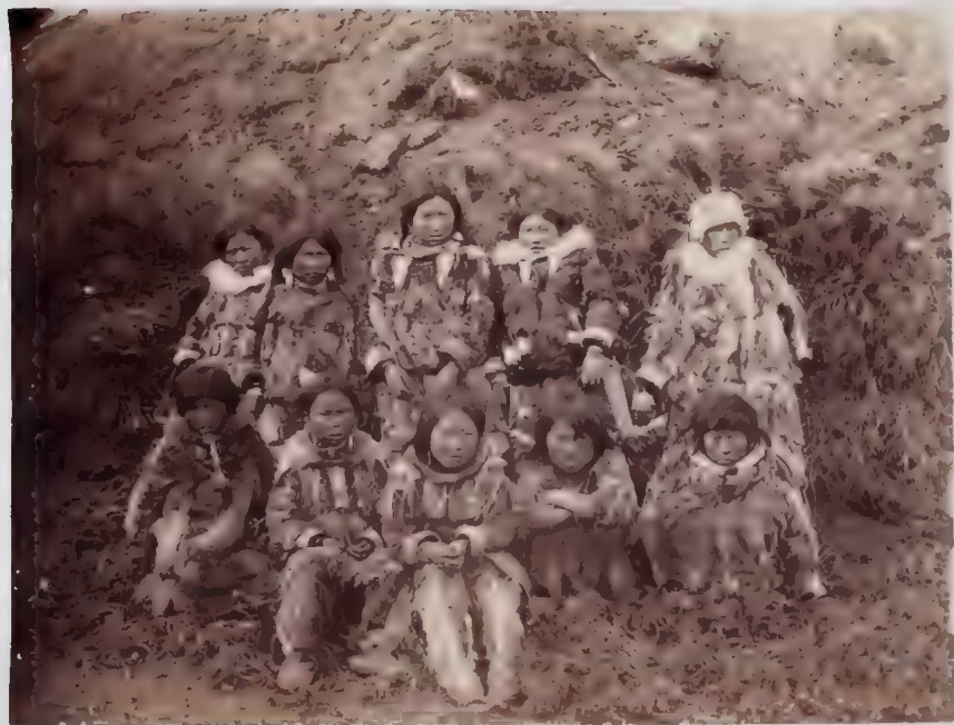
Group of Eskimo Women & Girls.